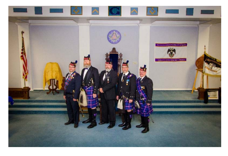
Knights of St. Andrew who performed the 29°