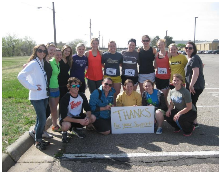
Students and staff at the 2014 Run/Walk

Information on this event will be available in the Scottish Rite Office at 785-827-9006.