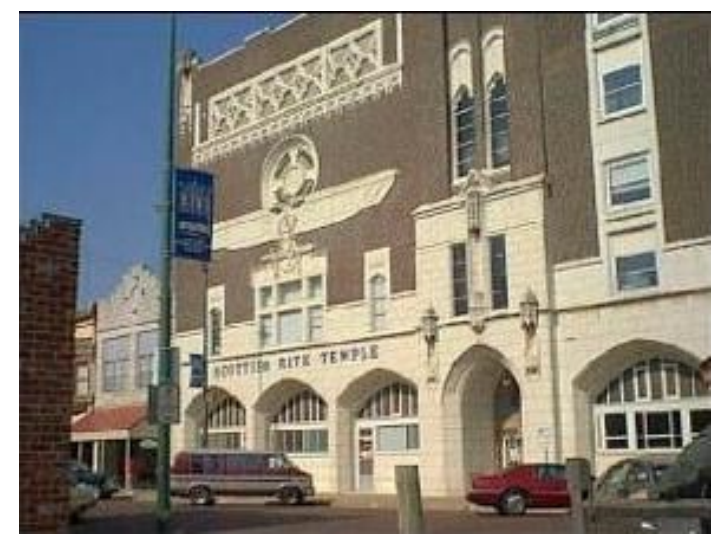
Ft. Scott Scottish Rite Temple 110 S. Main Street Ft. Scott. Kansas

The Fort Scott Valley is presently undergoing a sales of its Temple in Ft. Scott and a major relocation.